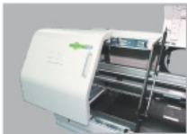
Sliding Side Cover Easy to open and close by sliding way Sliding Side Cover 방식으로 사용자 편리