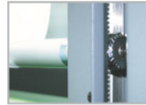
Gear type tension bar Gear type tension bar keep supplying uniform force to the surface of media evenly 기어 타입 텐션바 적용으로 미디어에 균일한 장력을 유지하여 미디어 롤어짐 방지