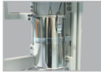
Waste Ink Tank Automatic alarm system for waste ink tank 폐잉크를 레벨센서 장착으로 폐잉크 비움시기 자동 알림